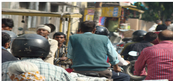
The roads are exciting too!

We travelled many miles on trains mini bus taxis and less miles on Tuk Tuks. All exciting journeys, The trains whisk by fields with sugar beet, forest, brick making and dung pat drying. The stations are crowded with families sitting on the concrete., or people just sleeping. Walking along the railway is not discouraged.