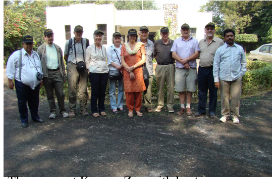
The group at Kanpur Zoo with hosts