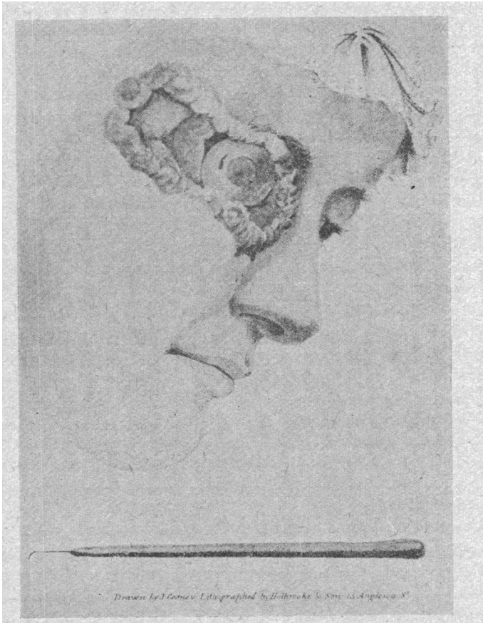
“ Jacob's Ulcer ” and Jacob's cataract needle, from the original illustration. ( Dublin Hospital Reports , 1827).

“ Observations respecting an ulcer of Peculiar Character which Attacks the Eyelid and Other Parts of the Face ” appeared in the Dublin Hospital Reports for 1827. Here Jacob describes with