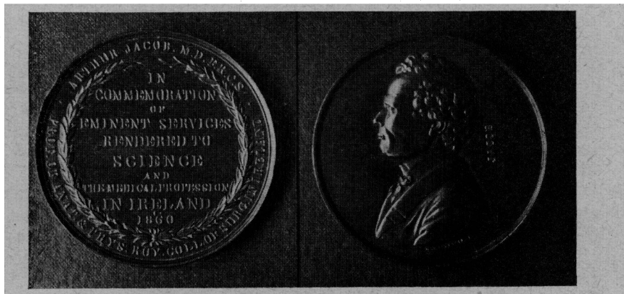
The Medal presented to Arthur Jacob.